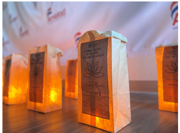
Amistad lighted 23 luminarias in honor of the victims who lost their lives on August 3rd.