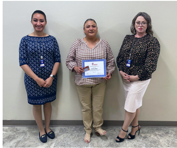
Guardianship Case Manager