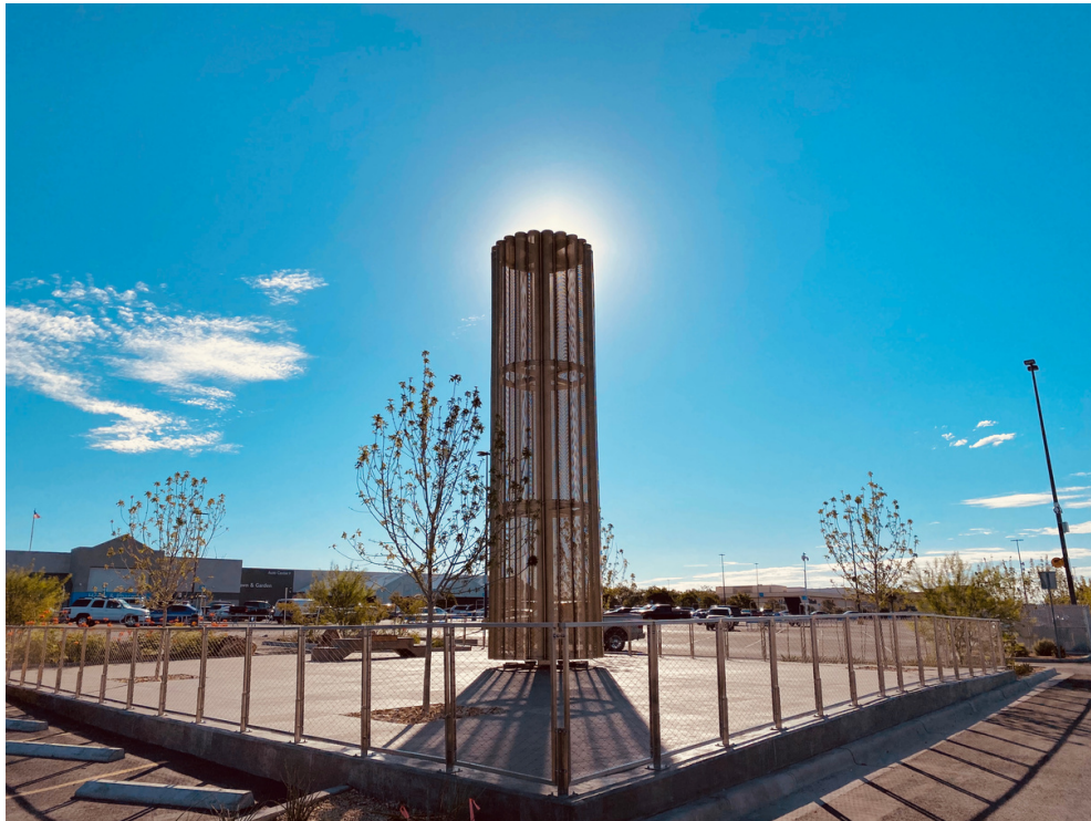
"Grand Candela" Memorial at Walmart - Cielo Vista honoring the lives lost on August 3, 2019

August 3, 2019, marked our community forever with the horrific crime committed at Walmart. Chaos and fear instantly spread throughout the city, followed by shock, anger, and sadness. In the face of adversity, our great El Paso community came together in solidarity to help in any way possible, showing the many kind-hearted people we have in our city. On this day, let us remember and honor the lives of those our community lost and those who have been deeply affected by this tragedy. As our community continues to heal, let us remain united and strong as ever, #ELPASOSTRONG.